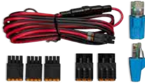
Accessories included with the Cerbo GX

This communication-centre allows you to always have perfect control over your system from wherever you are and to maximise its performance. Simply access your system via our Victron Remote Management (VRM) portal, or access it directly, using the optional GX Touch 50 screen, a Multi-Functional Display (MFD) or our VictronConnect app thanks to its Bluetooth capability.