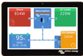
GX Touch 50 (optional display for Cerbo GX)

Instantly monitor the battery state of charge, power consumption, power harvest from PV, generator, and mains, or check tank levels and temperature measurements. Easily control the shore power input current limit, (auto)start/stop generator(s) or change any setting to optimise the system. Follow up on alerts, perform diagnostic checks and resolve complications remotely.